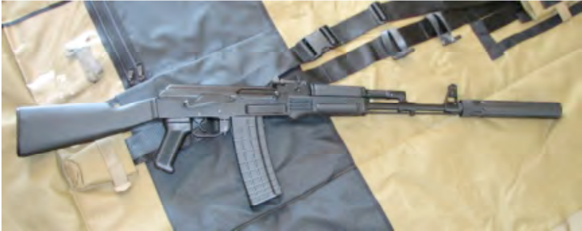
Fig. 2 Bulgarian 5.56mm AK variant with Vortex®, P/N 6026V and M4DC Sound Suppressor, P/N 4001. Note: the M4DC will also work on an M4/M16-type weapon when fitted with the G6A2 Vortex®, P/N 1001V.

The forthcoming AK47/AKM Blank Firing Adaptor (BFA) is machined from 8620 steel and features a hardened 416 stainless steel shaft for long service life. The body of the BFA is supplied in a very durable powder coat finish. The robust dimensions, manner of construction and use of high-grade materials offer a quantum improvement over the issue BFA item. Also, a grenade ring is attached to the center shaft to prevent loss in the field. Two BFAs will be available (P/N's TBA): one for 5.45/5.56mm weapons and another unit for 7.62mm M43 caliber weapons, when equipped with the Vortex® AK47/AKM flash eliminator