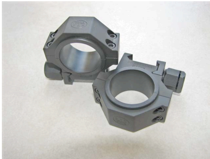
30mm WEDM Low (0.265") Rings, P/N 7008

Smith Enterprise, Inc. Wire Electro Discharge Machined (Wire EDM) are the only rings made today with this absolutely stress-free manufacturing process. When absolute fail-safe operational requirements dictate, you can count on SEI WEDM Ring Sets. The WEDM Low Ring Set, P/N 7008 is optimized for optics with exit objectives 44mm and smaller, when used in conjunction with SEI M14 NSN Wire EDM Mounts, P/N's 2006 or 2008. For Exit Objectives up to and including 56mm, choose the WEDM Tall Ring Set, P/N 7010.